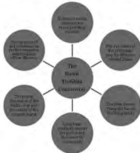
Figure 1 – Factors contributing to the racial profiling controversy

Yet, the more we know, the more we don't know. There is still more work to be done. The most important question in racial profiling research continues to be;