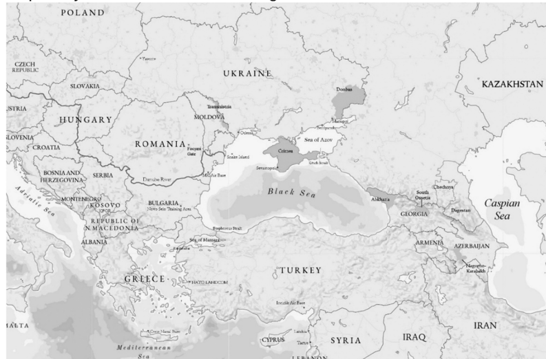
Map: Grey zones in the Black Sea region