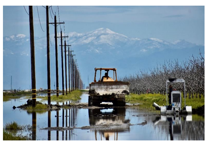
Kern County farmer Carl Fanucchi works a levee near County Line and Rowlee roads east of Delano as Poso Creek water continues to rise.

California's Central Valley is divided into three basins: the Sacramento Valley, the San Joaquin Valley, and the Tulare Lake Basin. The total mean annual inflow to the Sacramento and San Joaquin valleys is approximately 23.1-million-acre feet (AF), but annual flows have ranged from a low of 6.2 million AF in 1977 to a high of 52.7 million AF in 1983.7 An AF is 326,000 gallons of water, or enough to cover a football field with water one foot deep.<sup>8</sup> In the Tulare Lake Basin the Kings, Kaweah, Tule, and Kern Rivers have a combined mean annual runoff of approximately 2 million AF.<sup>9</sup>