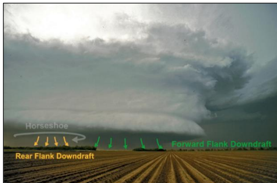
Figure 2. Selected Components of Certain Thunderstorms