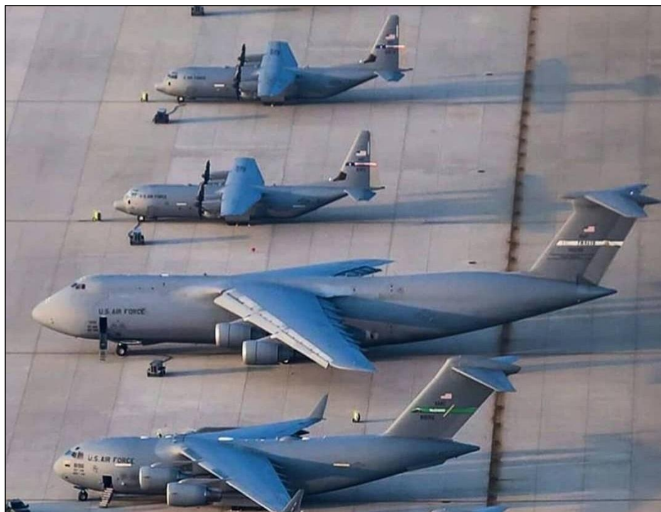
Figure 2. C-130, C-5 and C-17 Comparison