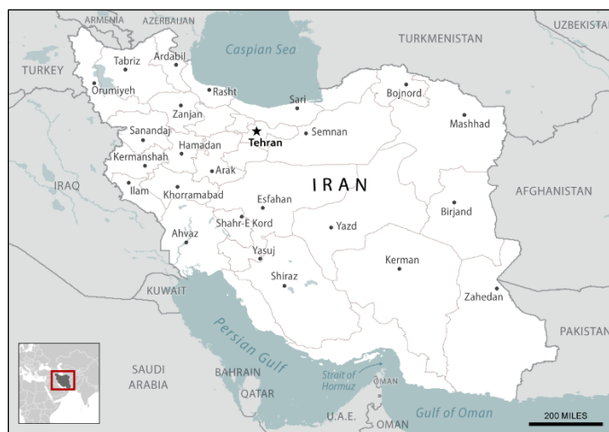
Figure 1. Iran at a Glance

The Islamic Republic of Iran, the second-largest country in the Middle East by size (after Saudi Arabia) and population (after Egypt), has for decades played an assertive, and by many accounts destabilizing, role in the region and beyond. Iran also derives influence from its oil reserves (the world's fourth largest) and its status as the world's most populous Shia Muslim country.