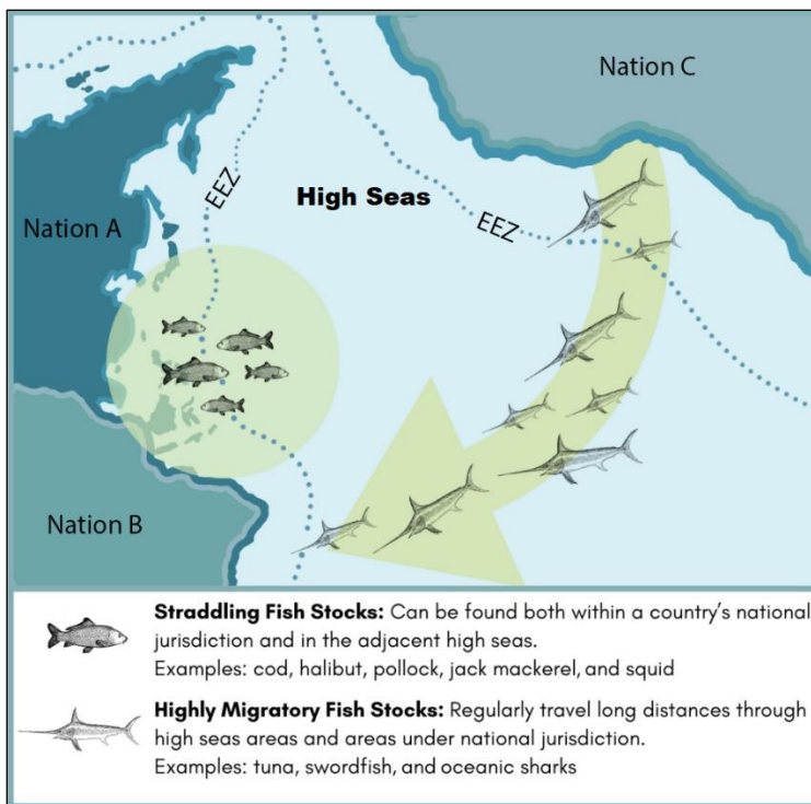
Figure 1. Straddling and Highly Migratory Fish Stocks