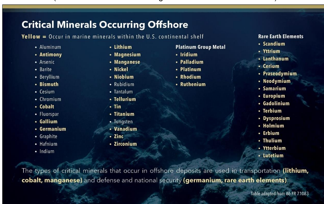
Figure 2. Critical Minerals Occurring Offshore (with subset of minerals occurring on the U.S. outer continental shelf)