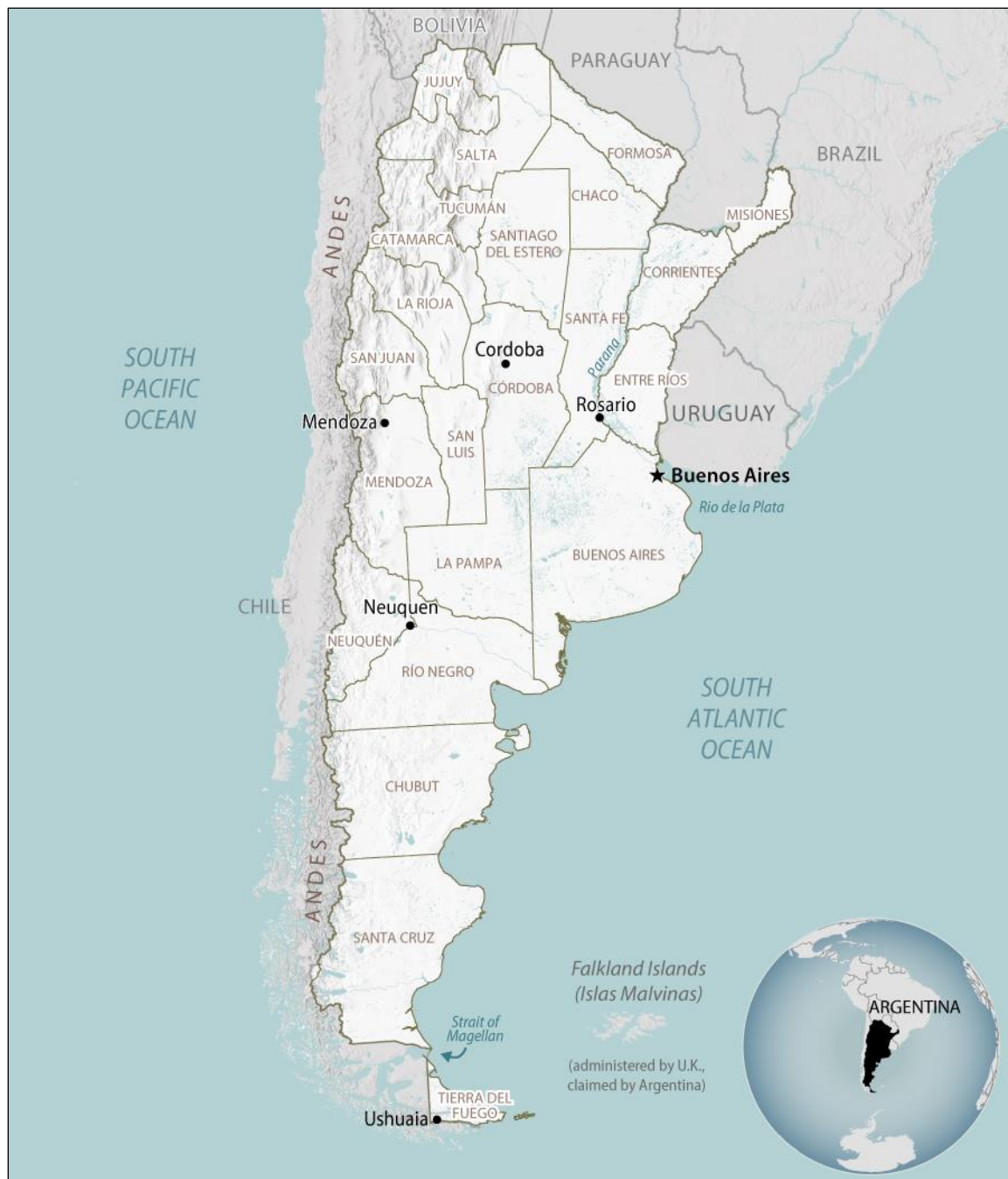
Figure I. Map of Argentina with Provinces and Selected Cities