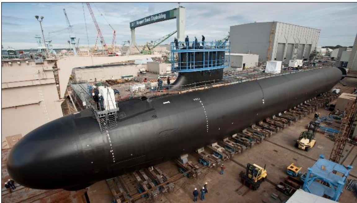
Figure 1. Virginia-Class Attack Submarine

Source: Cropped version of photograph accompanying Dan Ward, “Opinion: How Budget Pressure Prompted the Success of Virginia-Class Submarine Program,” USNI News , November 3, 2014. The caption credits the photograph to the U.S. Navy and states that it shows USS Minnesota (SSN-783) under construction in 2012.