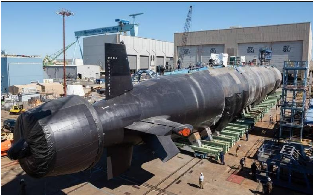
Figure 2. Virginia-Class Attack Submarine