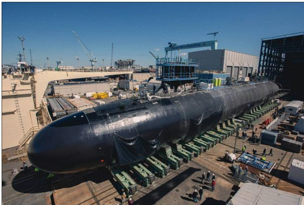
Figure 3. Virginia-Class Attack Submarine

Source: Photograph accompanying Megan Eckstein, “The US Navy Is Spending Billions to Stabilize Vendors. Will It Work?” USNI News , September 8, 2023. The caption credits the photograph to Ashley Cowan/HII and states that it shows the USS New Jersey (SSN-796) being moved at HII/NNS in April 2022.