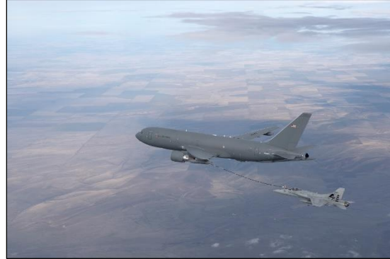
Figure 6. The KC-46A Pegasus