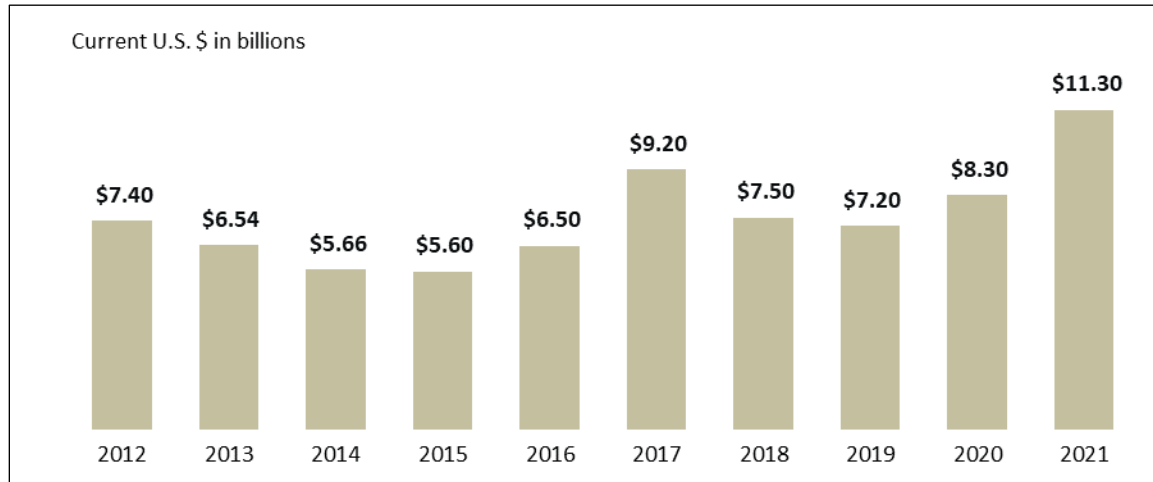
Figure 1. Israel's Annual Arms Exports: 2012-2021

Source: Created by CRS. Information from Israel Ministry of Defense, International Defense Cooperation Directorate (SIBAT), as reported by various media sources.