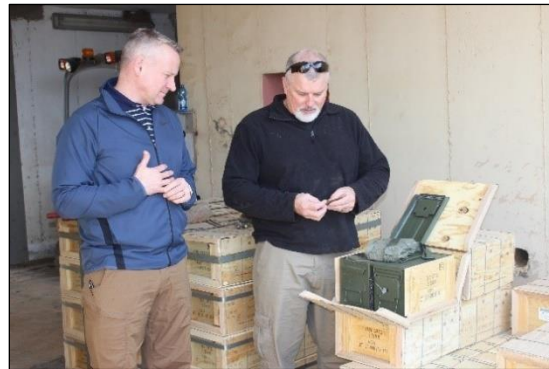
Figure 10. Army Officers Inspect WRSA-I