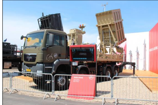
Figure 8. Iron Dome Launcher

In March 2014, the U.S. and Israeli governments signed a co-production agreement to enable the manufacture of components of the Iron Dome system in the United States, while also providing the U.S. Missile Defense Agency (MDA) with full access to what had been proprietary Iron Dome technology. 95 U.S.-based Raytheon is Rafael's U.S. partner in the co-production of Iron Dome. 96 In 2020, the two companies formed a joint venture incorporated in the United States known as "Raytheon Rafael Area Protection Systems (R2S)." Tamir interceptors (the U.S. version is called SkyHunter) are manufactured at Raytheon's missiles and defense facility in Tucson, Arizona and elsewhere and then assembled in Israel. Israel also maintains the ability to manufacture Tamir interceptors within Israel.