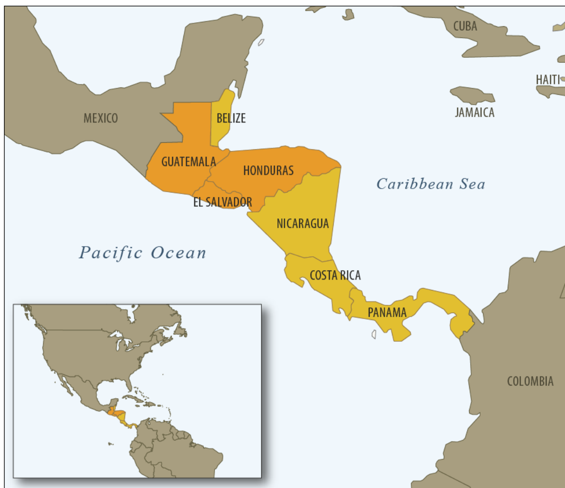
Figure 1. Map of Central America